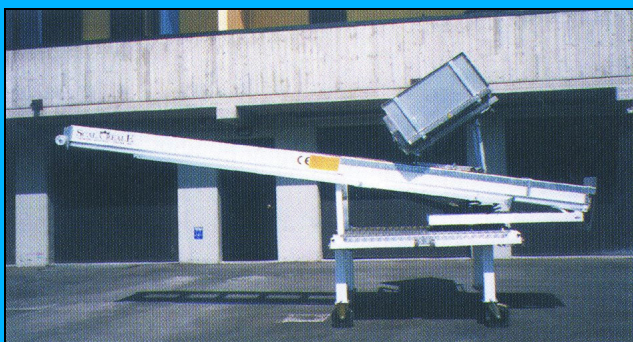
The lift can be quickly and safely unloaded from the pick-up to stand-alone and work independently or even left in the warehouse for individual use of the pickup. The lift base may be equipped with own wheels for easier transfer.