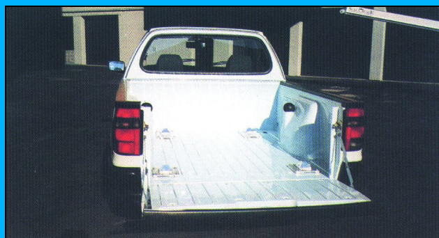
After unloading of the lift the pick-up body is empty and ready to be used for other transportation purposes.