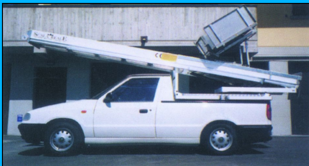
Finally the small size and reduced vehicle weight assure very practicable and safe driving.

Magica 2000 is available in 18 and 21.1 m versions both featuring 200 kg capacity. All operations are electrically controlled and it is possible to equip the lift with hydraulic stabilizers. Very high quality standards (all items are complying with European Directives 98/37/CE), top technical reliability over several production years as well as a strong and easy construction make this unit an ideal system for moving furniture in and out of elevated floor apartments.