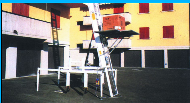
The lift is standing off the pick-up and working separately. All telescopic sliding sections are out of aluminum EN AW-7020 assuring 200 kg rated load. All operations are performed electrically and controlled on a push-button panel; on the top of the lift a push button for down and stop operation is available.